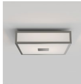
CODE: 1121071 FINISH: MATT NICKEL

TO MAINTAIN THIS PRODUCT TO ITS BEST CONDITION, PLEASE VIEW OUR CARE AND CLEANING GUIDE ON THE SUPPORT SECTION OF THE ASTRO WEBSITE.