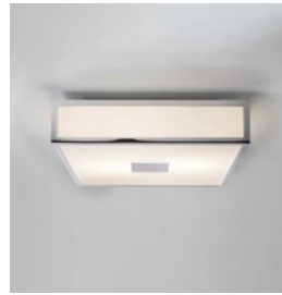
CODE: 1121040 FINISH: POLISHED CHROME