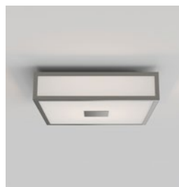
CODE: 1121071 FINISH: MATT NICKEL

TO MAINTAIN THIS PRODUCT TO ITS BEST CONDITION, PLEASE VIEW OUR CARE AND CLEANING GUIDE ON THE SUPPORT SECTION OF THE ASTRO WEBSITE.