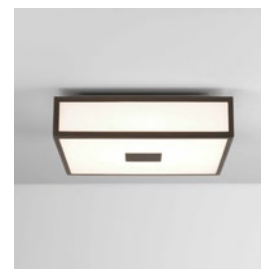
CODE: 1121044 FINISH: BRONZE