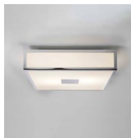
CODE: 1121040 FINISH: POLISHED CHROME