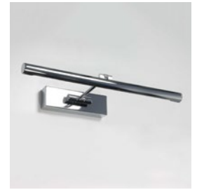
CODE: 1115008 FINISH: POLISHED CHROME