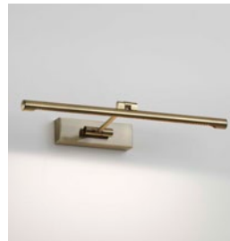
CODE: 1115012 FINISH: ANTIQUE BRASS

TO MAINTAIN THIS PRODUCT TO ITS BEST CONDITION, PLEASE VIEW OUR CARE AND CLEANING GUIDE ON THE SUPPORT SECTION OF THE ASTRO WEBSITE.