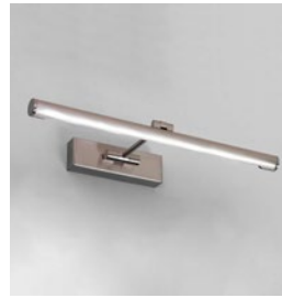
CODE: 1115007 FINISH: BRUSHED NICKEL