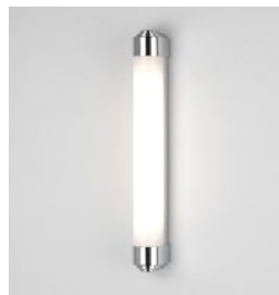
CODE: 1110008 (8044) FINISH: POLISHED CHROME