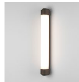
CODE: 1110010 (8046) FINISH: BRONZE

TO MAINTAIN THIS PRODUCT TO ITS BEST CONDITION, PLEASE VIEW OUR CARE AND CLEANING GUIDE ON THE SUPPORT SECTION OF THE ASTRO WEBSITE.