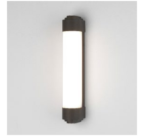
CODE: 1110009 (8045) FINISH: BRONZE

TO MAINTAIN THIS PRODUCT TO ITS BEST CONDITION, PLEASE VIEW OUR CARE AND CLEANING GUIDE ON THE SUPPORT SECTION OF THE ASTRO WEBSITE.