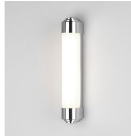
CODE: 1110007 (8043) FINISH: POLISHED CHROME