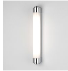
CODE: 1110008 (8044) FINISH: POLISHED CHROME