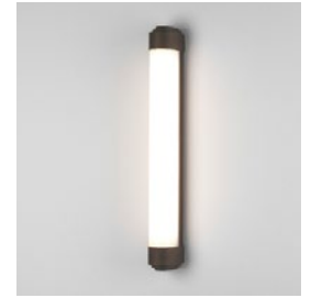
CODE: 1110010 (8046) FINISH: BRONZE

TO MAINTAIN THIS PRODUCT TO ITS BEST CONDITION, PLEASE VIEW OUR CARE AND CLEANING GUIDE ON THE SUPPORT SECTION OF THE ASTRO WEBSITE.