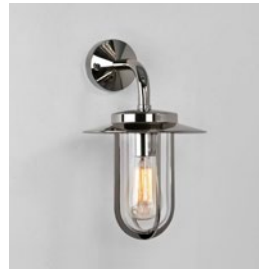
CODE: 1096001 FINISH: POLISHED NICKEL