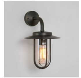
CODE: 1096009 FINISH: BRONZE

TO MAINTAIN THIS PRODUCT TO ITS BEST CONDITION, PLEASE VIEW OUR CARE AND CLEANING GUIDE ON THE SUPPORT SECTION OF THE ASTRO WEBSITE.