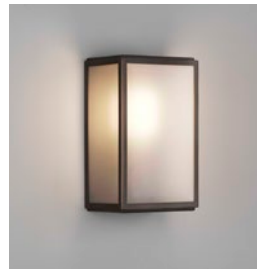
CODE: 1095030 FINISH: BRONZE

THIS PRODUCT IS NOT SUITABLE FOR INSTALLATION WITHIN FIVE MILES OF THE COAST. FOR THESE ENVIRONMENTS, PLEASE FILTER PRODUCTS ON THE ASTRO WEBSITE BY 'COASTAL'.