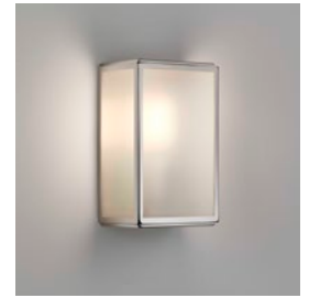
CODE: 1095009 FINISH: POLISHED NICKEL