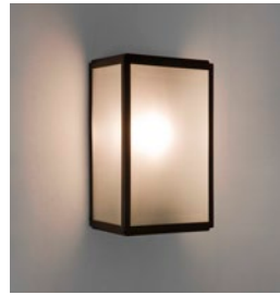
CODE: 1095008 FINISH: MATT BLACK