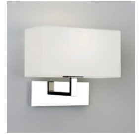
CODE: 1080011 FINISH: POLISHED CHROME