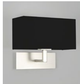
CODE: 1080022 FINISH: MATT NICKEL