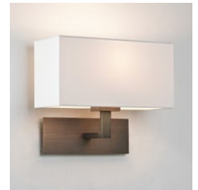
CODE: 1080044 FINISH: BRONZE

TO MAINTAIN THIS PRODUCT TO ITS BEST CONDITION, PLEASE VIEW OUR CARE AND CLEANING GUIDE ON THE SUPPORT SECTION OF THE ASTRO WEBSITE.