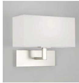
CODE: 1080009 FINISH: MATT NICKEL