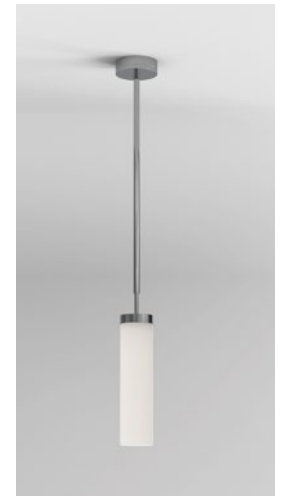
CODE: 1060007 (8523) FINISH: POLISHED CHROME

TO MAINTAIN THIS PRODUCT TO ITS BEST CONDITION, PLEASE VIEW OUR CARE AND CLEANING GUIDE ON THE SUPPORT SECTION OF THE ASTRO WEBSITE.