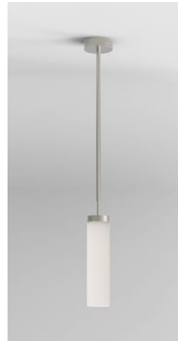
CODE: 1060008 (8559) FINISH: MATT NICKEL