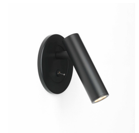
CODE: 1058067 FINISH: MATT BLACK