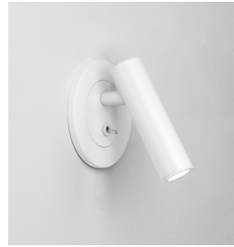
CODE: 1058062 FINISH: MATT WHITE