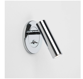
CODE: 1058064 FINISH: POLISHED CHROME