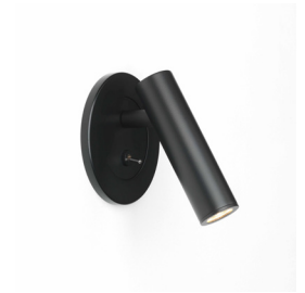
CODE: 1058067 FINISH: MATT BLACK