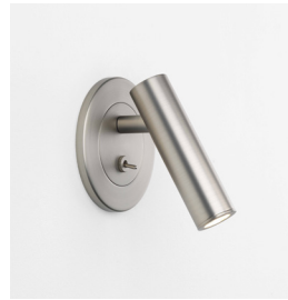
CODE: 1058065 FINISH: MATT NICKEL