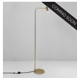
CODE: 1058107 FINISH: MATT GOLD

TO MAINTAIN THIS PRODUCT TO ITS BEST CONDITION, PLEASE VIEW OUR CARE AND CLEANING GUIDE ON THE SUPPORT SECTION OF THE ASTRO WEBSITE.