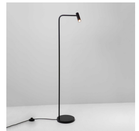
CODE: 1058003 FINISH: MATT BLACK