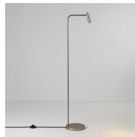
CODE: 1058058 FINISH: MATT NICKEL