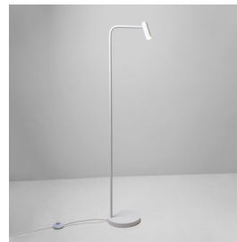
CODE: 1058002 FINISH: MATT WHITE