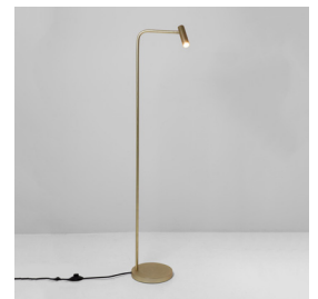
CODE: 1058104 FINISH: MATT GOLD