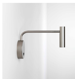
CODE: 1058056 FINISH: MATT NICKEL