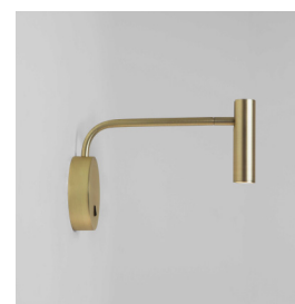
CODE: 1058105 FINISH: MATT GOLD

TO MAINTAIN THIS PRODUCT TO ITS BEST CONDITION, PLEASE VIEW OUR CARE AND CLEANING GUIDE ON THE SUPPORT SECTION OF THE ASTRO WEBSITE.