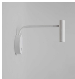
CODE: 1058032 FINISH: MATT WHITE