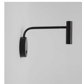
CODE: 1058033 FINISH: MATT BLACK